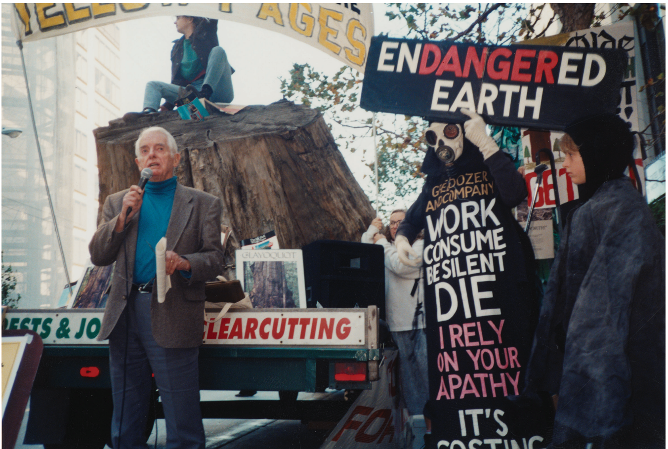
David Brower at Endangered Earth rally

THE BANCROFT LIBRARY GALLERY UNIVERSITY OF CALIFORNIA, BERKELEY OCTOBER 6, 2023–NOVEMBER 15, 2024