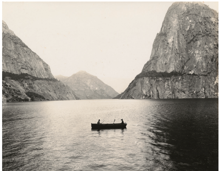
Hetch Hetchy Valley [left] and Hetch Hetchy Reservoir [right]