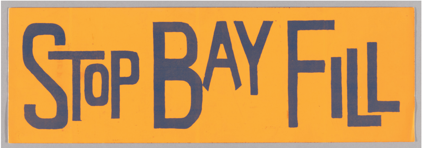
Stop Bay Fill bumper sticker, Save San Francisco Bay Association Records, BANC MSS 87/29 c, The Bancroft Library, University of California, Berkeley