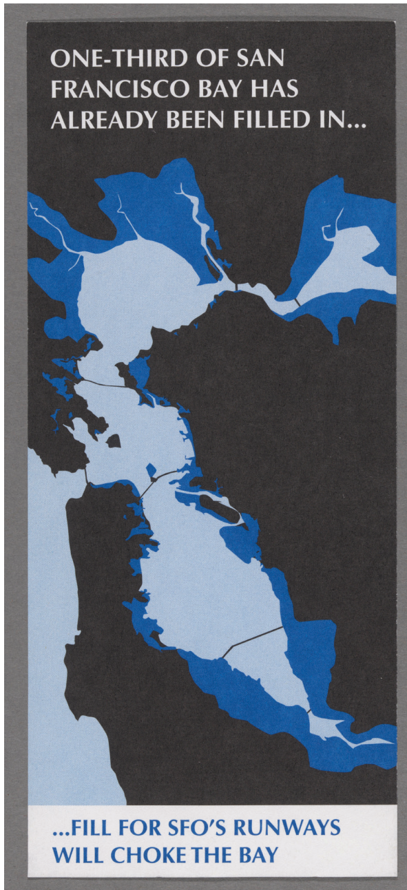
Save The Bay pamphlet, Save San Francisco Bay Association Records, BANC MSS 87/29 c, The Bancroft Library, University of California, Berkeley

The second section in the exhibit highlights the Save San Francisco Bay movement and the creation of the San Francisco Bay Conservation and Development Commission, or BCDC. With the rise of another development boom in the Bay Area after World War II, activists organized against plans to fill in large segments of the bay. Their movement eventually led to the creation of BCDC by the California state government. This marked two important steps in the evolution of Bay Area environmentalism. First, it gave environmental considerations a permanent place in state government. Second, it signified a balanced approach between economic development and environmental conservation. Use the questions below to further explore these events and what they meant for environmentalism in the Bay Area.