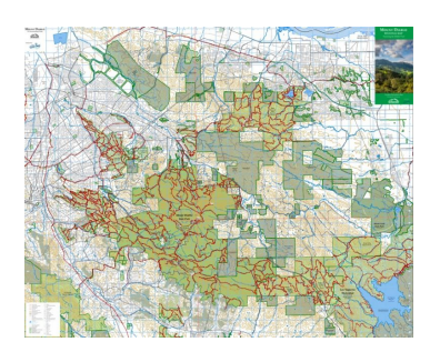
Map of Mount Diablo

Read more about Roger Eardley-Pryor's interview with Ruckel here.